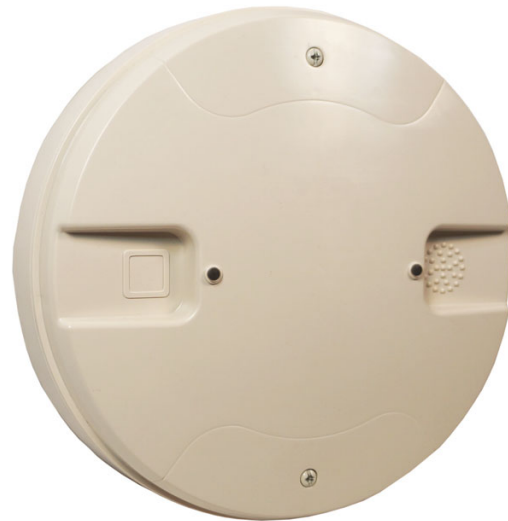
W-GATE Wireless System Gateway