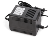
AC24V/3A Power Adapter